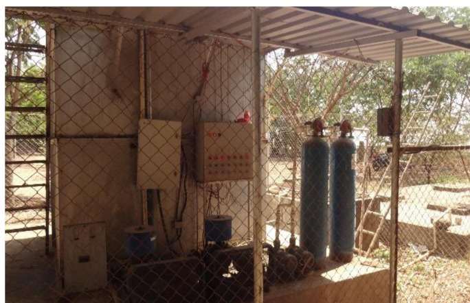
Assembly of Sewage Treatment Plant