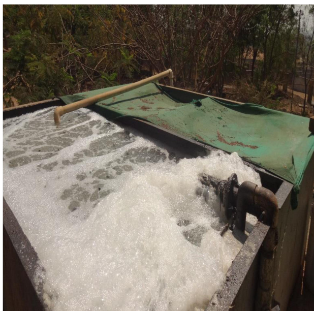
Liquid Waste Management Plant