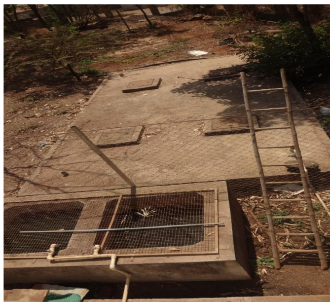
Septic Tank having capacity 1.25lakh litres